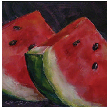
Watermelon Slices-Brian Cameron

In a nod to "Savor Cannon Beach," this invitational show will highlight artwork that is thematically related to growing, preparing and enjoying food. Works will include