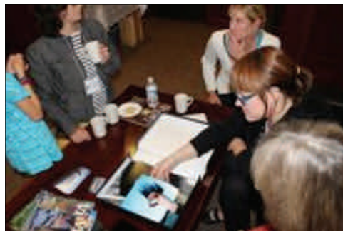
Photo Review, 2012