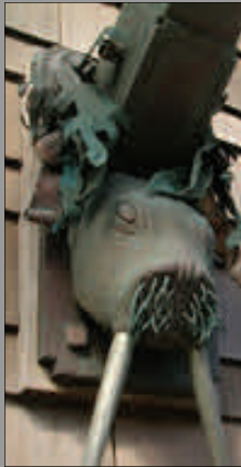
Detail Gallery Exterior